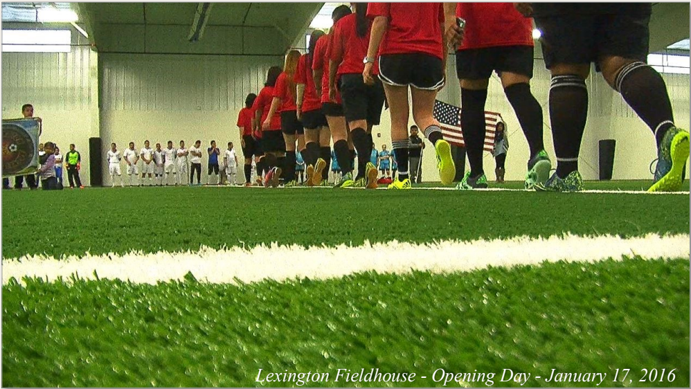
Lexington Fieldhouse - Opening Day - January 17, 2016