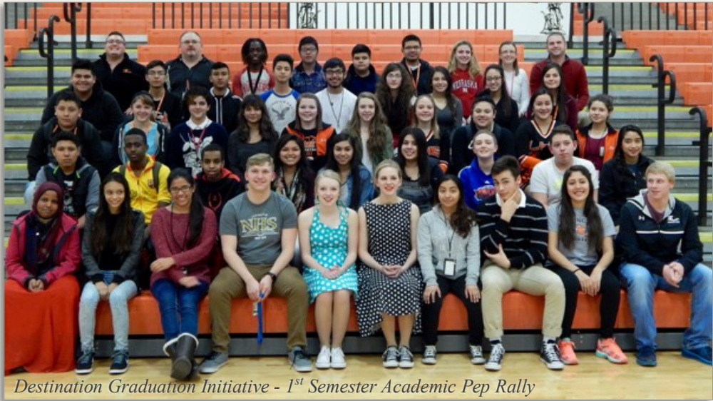
Destination Graduation Initiative - 1 st Semester Academic Pep Rally

With strong leadership we continue a philanthropic agenda which supports a complex fabric of issues where donor dollars have great impact and will ensure a bright future for everyone who calls this region home.